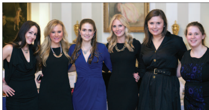
Junior League members smile for the camera at Perfect Pairings.