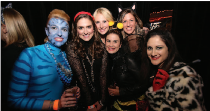
JLC members dressed up for a Halloween party at Zellas.

Every effort has been made to report all 2013-2014 contributions fully and accurately. We apologize for any errors or omissions and ask donors to forward corrections to the Operations Director of the Junior League of Chicago. Thank you for your understanding and for your generosity to the Junior League of Chicago.