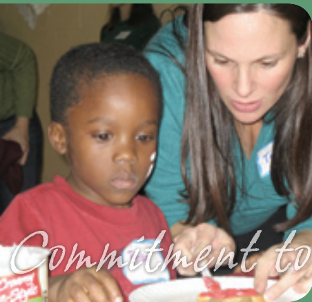
Commitment to the Community