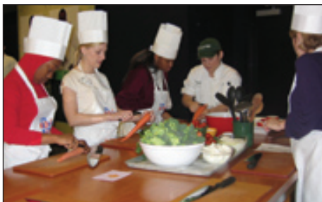
At the Marshall Field's Culinary Studio JLC volunteers, girls from the Teen Exodus program and chefs from Marshall Field's work together creating healthy food.