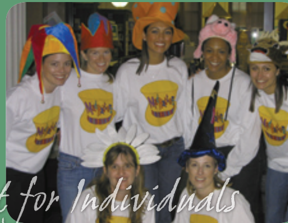
Respect for Individuals