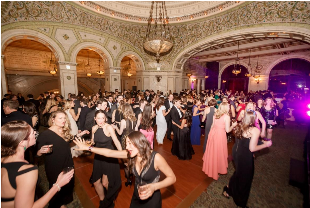
The Junior League of Chicago's Annual Gala in full swing at the Chicago Cultural Center.