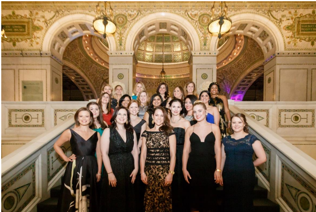
The Junior League of Chicago's Annual Gala Committee members in Preston Bradley Hall of the Chicago Cultural Center.