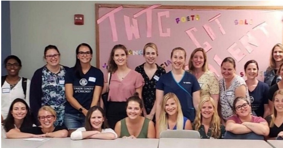
The JLC's Women's Treatment Center Committee (2019 - 2020)

In early-September, 2019, the Junior League of Chicago (JLC) received a $5,000 grant from the A. Montgomery Ward Foundation, Bank of America, N.A., Co-Trustee, to support its community-based efforts at The Women's Treatment Center (TWTC), which supports women who are recovering from addiction to rebuild their lives with their families and successfully re-enter the workforce. While women are in treatment, their children up to the age of five can live with them.