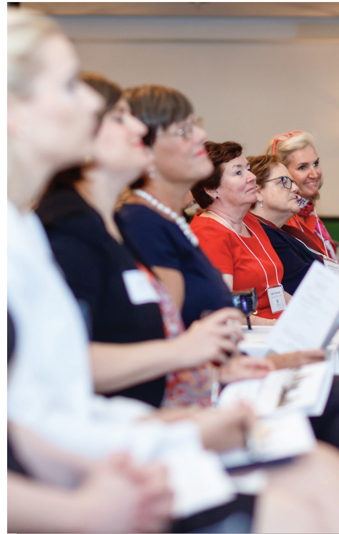
Past Presidents at Junior League of Chicago Annual Meeting